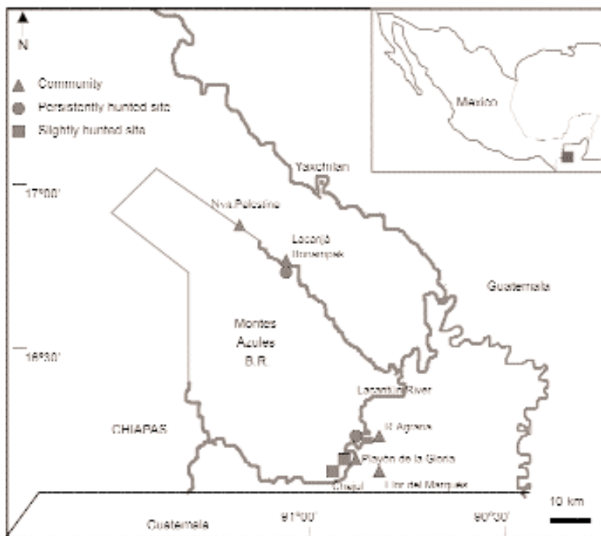
Figure 1. Study sites in the Lacandon Forest of Chiapas, Mexico.

game and non-game species with similar habitat requirements to those of the tapir (i.e., brocket deer, white-lipped peccaries, primates and cracids).