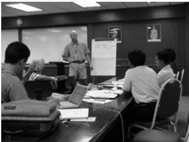
Habitat Threats Working Group.

During the First International Tapir Symposium held in Costa Rica, in November 2001, it became clear that one of the biggest concerns among tapir experts was the limited attention that has been given to the conservation of Malay tapirs and that TSG should give this species priority. As a consequence, the TSG decided to organise and hold a Malay Tapir Conservation Workshop in Asia. The European Association of Zoos and Aquaria (EAZA) Tapir Taxon Advisory Group (TAG), the IUCN/SSC Conservation Breeding Specialist Group (CBSG), and the Malaysian Department of Wildlife and National Parks (DWNP) kindly agreed to support this initiative and the first steps towards the organisation of this important meeting were taken about two years ago.