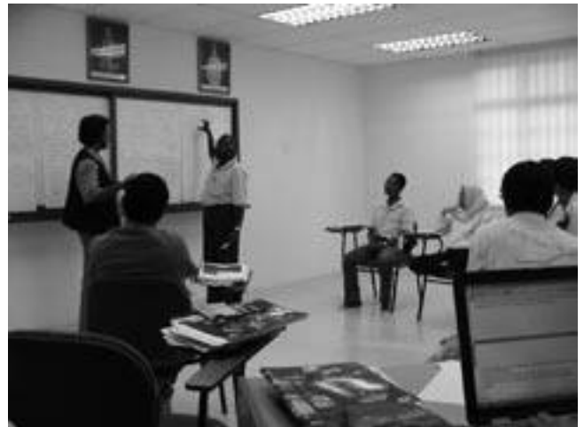
Species Management Working Group.

Recommendations coming from all four groups were put together and prioritised. The final outcome of the meeting will be a very detailed and updated action plan, listing and prioritising strategies and actions for the conservation of Malay tapirs. The CBSG editorial team is reviewing the first draft of the action plan, and as soon as we have the final version of the document we will print and distribute copies to all interested parties in Southeast Asia. Also, this document will be incorporated as the Malay Tapir Chapter in the next, revised edition of the IUCN/SSC Tapir Status Survey and Conservation Action Plan (1997).