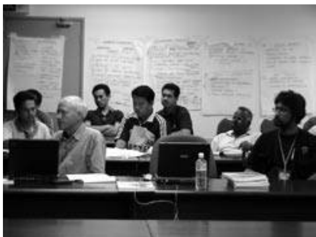
Plenary session.