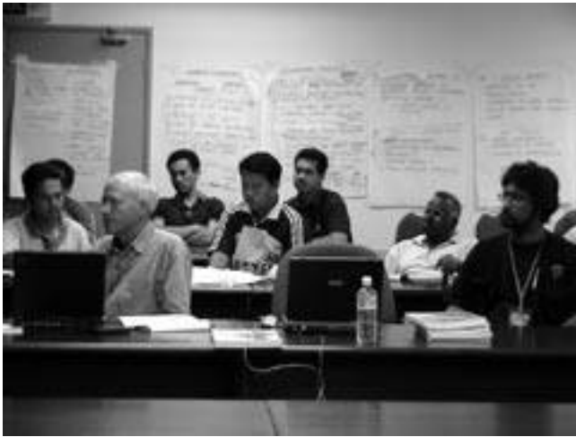
Plenary session.