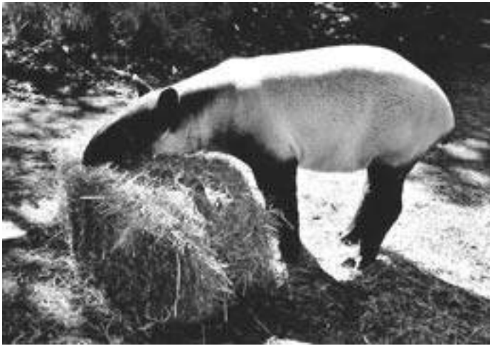
Figure 5. The calf uses a hay-bale for rubbing its head.

Adult Female Tapir – INDAH: Of the three types of feeding enrichment, the adult female spent the least time with the hay-bales. She spent the most amount of time with the jute sacks (Figure 1). There was a “not entirely significant” difference regarding the duration of time spent eating these objects ( p = 0.0854 , Friedman test). Accordingly, the adult female often just plucked off the leaves and the side branches of the suspended branches. The main branch remained almost entirely untouched. In contrast, the jute sacks were shaken and hollowed out with the help of her snout (Figure 4) or were nibbled at the corners. As a result, the contents were partially spread over the ground, where the calf or the adult female herself immediately ate them. The adult female repeatedly tried to push down the sack by using one of her front legs and placing it inside one of the slits. The hay-bales were moved a short distance within the enclosure by using the coconut rope to carry them. The adult female only ate the stuffing, but not the hay itself. In addition, she used the bales for scratching her belly.