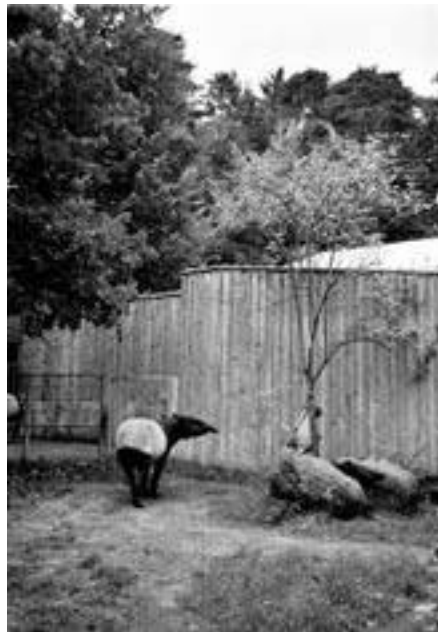
Figure 3. The adult male sniffs in the direction of a jute sack.