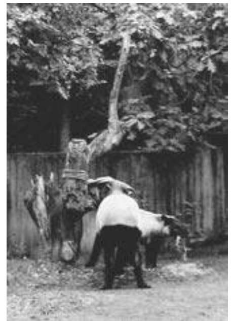
Figure 4. The adult female with her nose in the sack. The calf eats fallen hay.