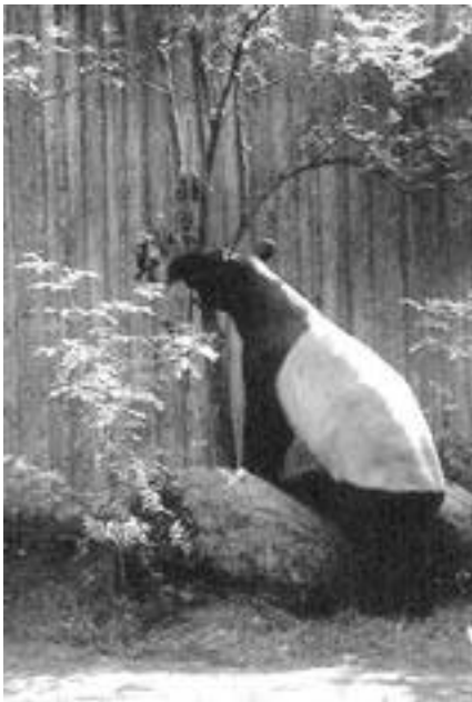
Figure 2. The adult male uses stones as “stairs” to reach a suspended branch.

could reach. Whenever all leaves and side branches were plucked off and the bark of the main branch was removed, the adult male repeatedly used the stones in front of the test construction as “stairs” to reach the higher branches. In contrast, the adult male paid little attention to the jute sacks. Most of the time, he kept a distance of at least one metre from the sack and only occasionally sniffed in its direction (Figure 3). However, if he pulled out pieces of the stuffing, he instantly galloped away with them to eat them in another part of his enclosure. This was only observed on two test days out of seven. The hay-bales aroused the adult male’s interest to a greater extent. On the first test day, he took the complete hay-bale to pieces in order to obtain its contents, and consumed a large part of the hay.