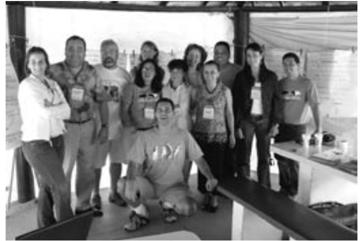
Participants of the Lowland Tapir PHVA Working Group that discussed tapir ex-situ conservation.

of this new Tapir Action Plan cannot be the end of our efforts. We must make sure that our new plan will be actively used by all organizations directly or indirectly involved with tapir conservation, and guarantee that all the actions listed as priorities will be implemented. We want this new Tapir Action Plan to be a LIVING DOCUMENT . This means it will constantly be reviewed, updated and adapted according to tapir conservation needs identified in the years to come. To this end, we have already established an Action Plan Implementation Taskforce, which has an enormous responsibility. The taskforce is responsible for promoting the new action plan throughout all tapir range countries in Central and South America, and Southeast Asia, reaching all possible stakeholders and key conservation players. Additionally, the members of the taskforce will be constantly reviewing the action plan and providing technical assistance, help and sup-