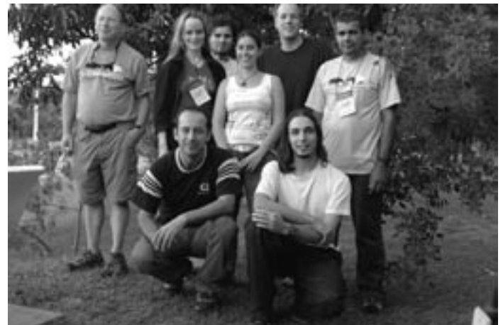
Participants of the Lowland Tapir PHVA Working Group that discussed education and communication.