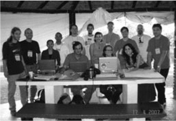
Participants of the Lowland Tapir PHVA Working Group that discussed tapir conservation in Protected Areas.