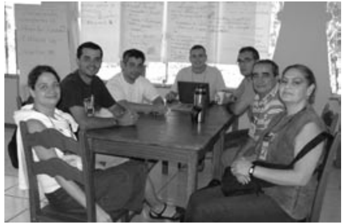
Participants of the Lowland Tapir PHVA Taskforce that discussed tapir epidemiology.

Regarding TSG documents, we have just managed to finalize our TSG Tapir Field Veterinary Manual , which will soon be available on our TSG website in English, Portuguese and Spanish. Additionally, we have finalized the very first draft of our TSG