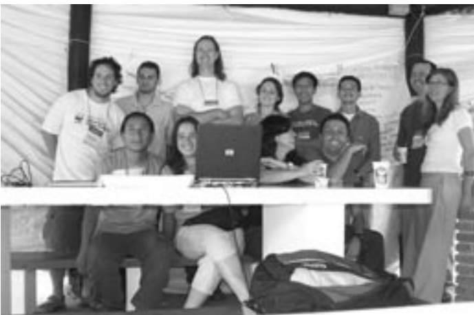
Participants of the Lowland Tapir PHVA Working Group that discussed tapir hunting.

The English version of the Malayan Tapir Action Plan and Spanish versions of the Mountain Tapir and Baird's Tapir Action Plans are available online on the TSG website and can be downloaded in PDF format. The latter two are in the process of being translated